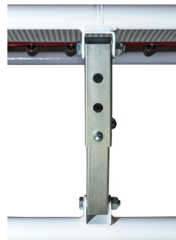
Height adjustable foot